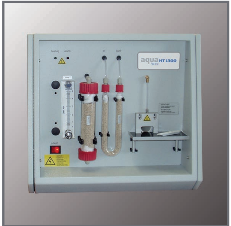
High Temperature Oven Module HT 1300

Samples are fed into small sample boats into the heat area of the oven. The working temperature is up to 1300 °C. Therefore, chemical reactions forming water as a reaction product can be controlled.