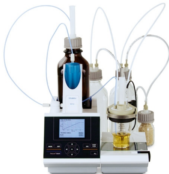
Volumetric KF Titrator

The titration is performed automatically until the endpoint indication of measurement. At the end of the measurement, results are shown in ppm water or several other units.